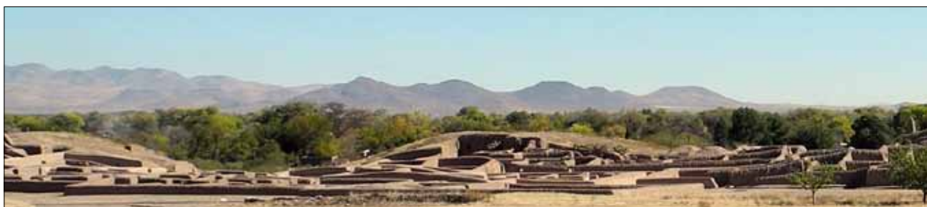
Paquimé ruins facing east

Birds and snakes, sometimes horned or feathered, are among the most common pottery imagery; and there are also mounds at Paquimé in the shape of a snake and a bird. Throughout North America, snakes are often associated with water and rain, and birds are often portrayed as animal spirits that help shamans on their journeys. Bird-snake-man combinations might