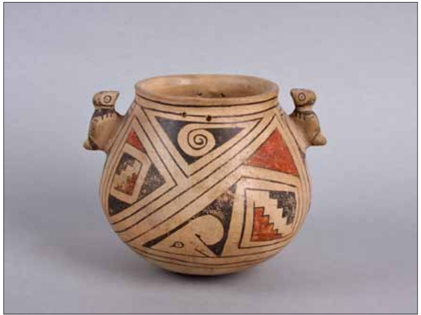
Casas Grandes pot with stylized macaw image and bird-shaped handles (photo courtesy of the Maxwell Museum of Anthropology, University of New Mexico, photographer Bernie Bernard, accession number 65.24.96)

Unlike its neighbors, Paquimé produced many pots in the shape of human figures. Women were almost always portrayed sitting with legs extended, men kneeling or sitting with one knee flexed. Women figures are often pregnant or breastfeeding. Men are commonly associated with serpents and women with birds.